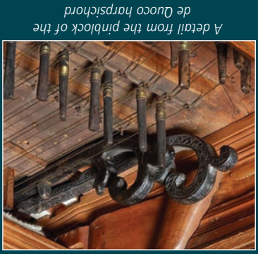
A detail from the pinblock of the de Guoco harpsichord